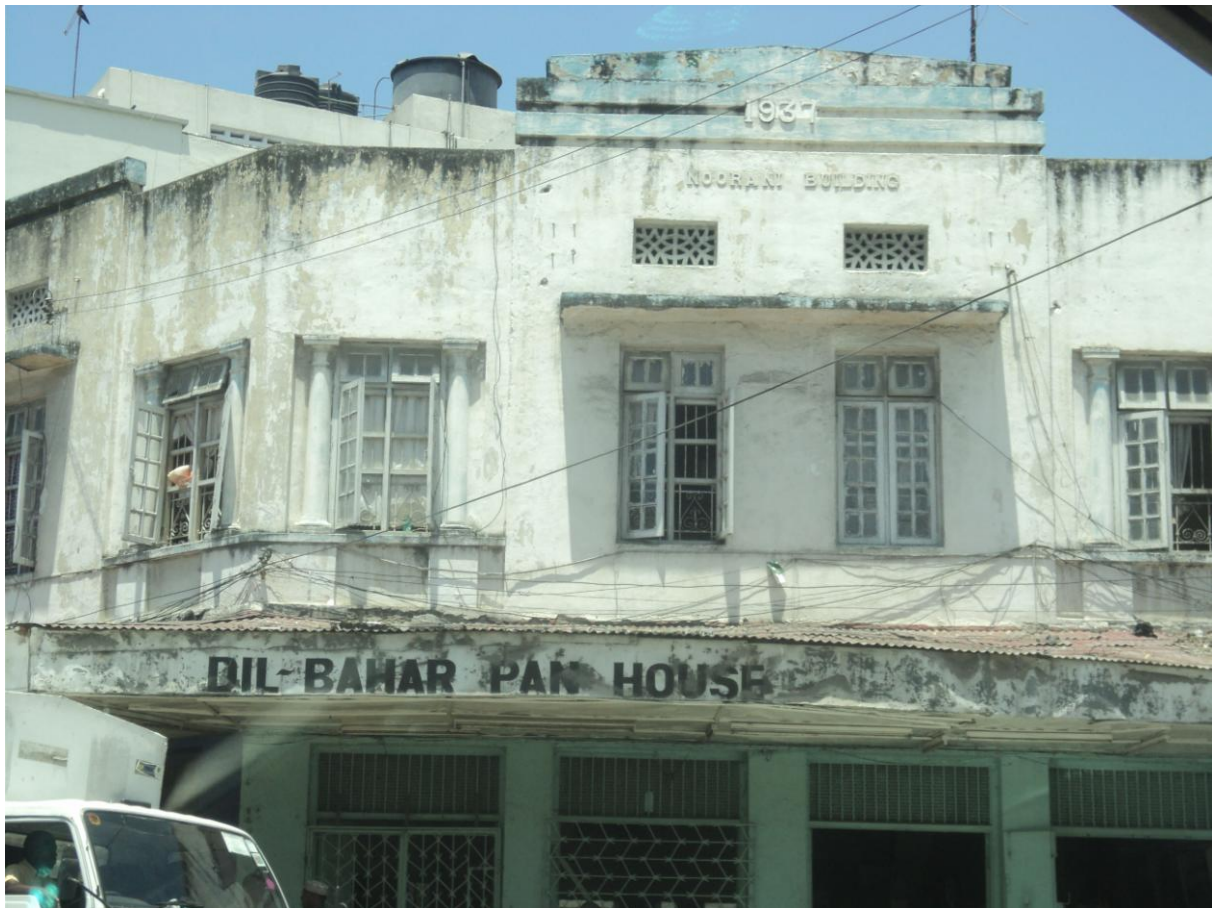
Only the remnants of this old name remains in Mombasa.