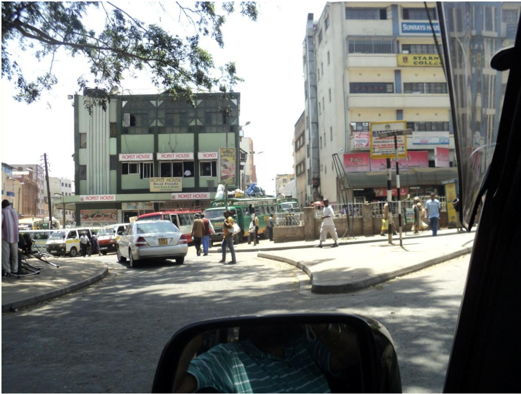
Supreme Hotel now Steak House which used to be best restaurant for Gujrati thali and food