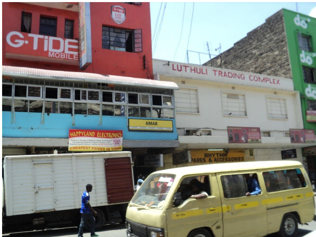
Amar Hotel in Campos Ribeiro Avenue. Name still same but different owners and recipes