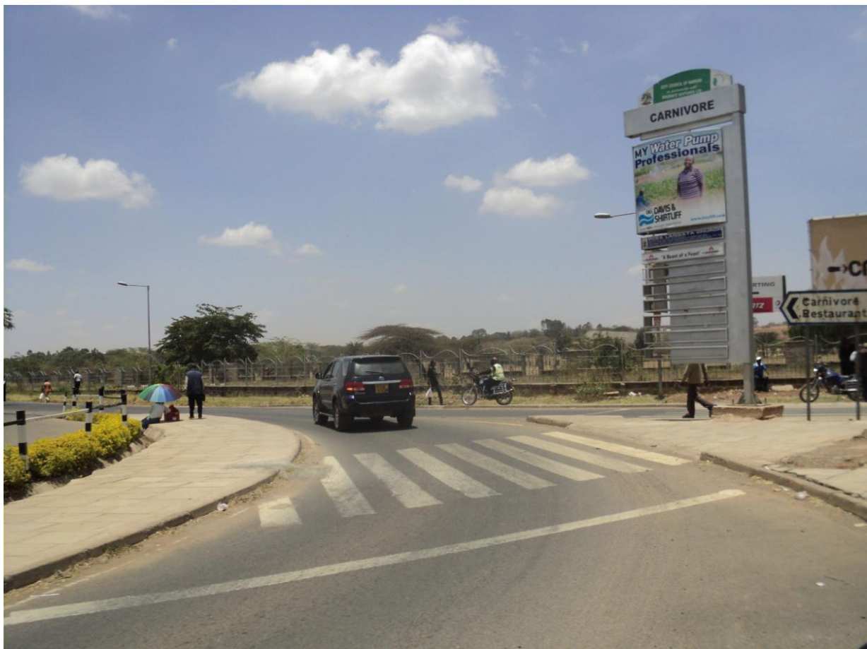
'The Carnivore' on the way to Langata