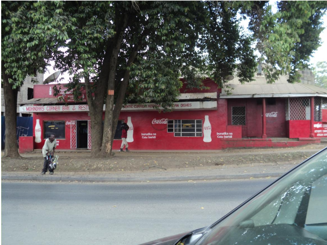
Mohinder's corner on Juja Road & Park Road. Same name but different management but I was assured the recipes were the original ones.