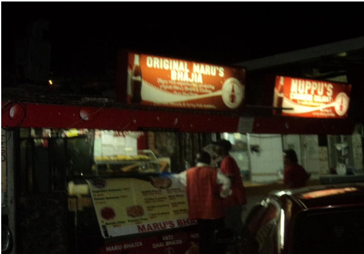
The 'Maru' name is still alive with Bhaajia named after him in some Nairobi Malls