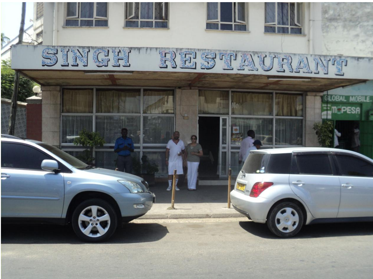
The popular Singh Restaurant in Mombasa-still going strong.